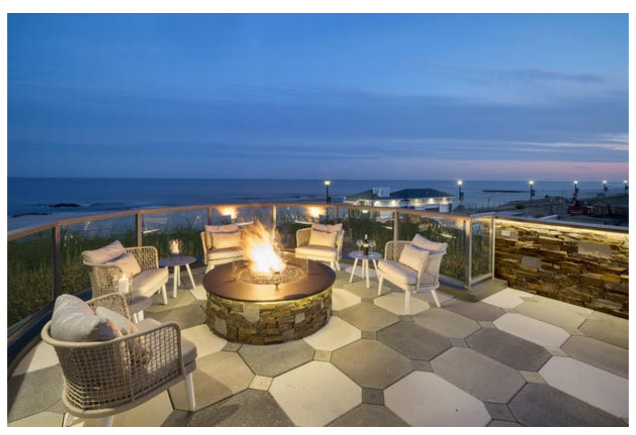
365 Ocean fire pit