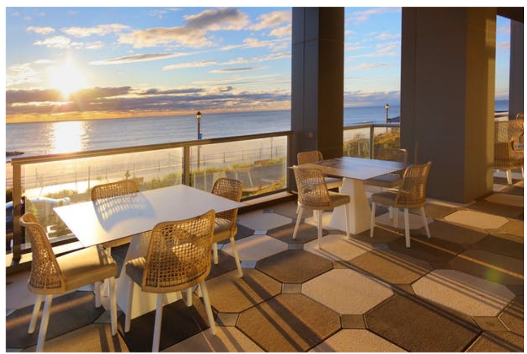
365 Ocean breezeway

With magnificent ocean views from every home, easy access to the beach, and plenty of outdoor spaces for relaxation, residents of the Marchetto Higgins Stieve-designed 365 Ocean community in Long Branch say the luxury condominium building is helping them lead a laid-back, fun-loving lifestyle this summer.