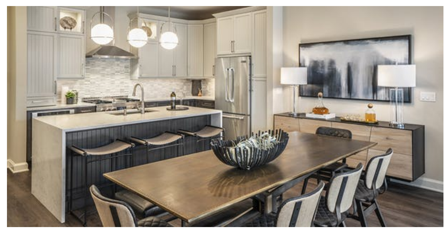
365 Ocean residence interior

Eugene Chertkov was attracted to 365 Ocean because its impeccable design comes at an excellent value.