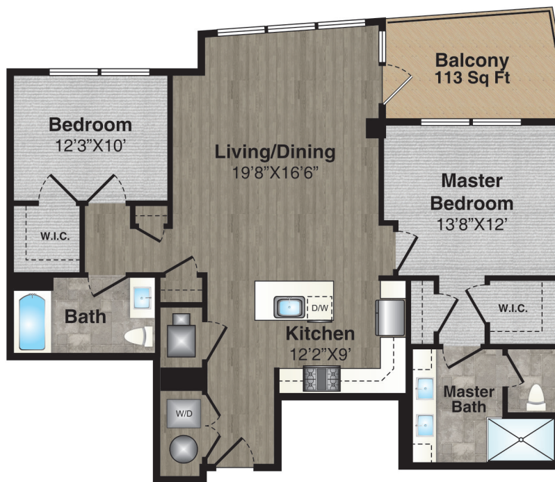
PENTHOUSE UNIT 708 1,275 Sq. ft.