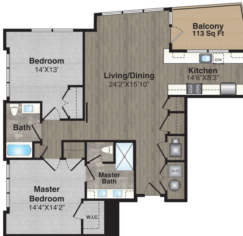
PENTHOUSE UNIT 706 1,468 Sq. ft.