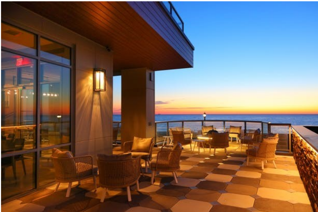
365 Ocean Club Room Exterior and Breezeway