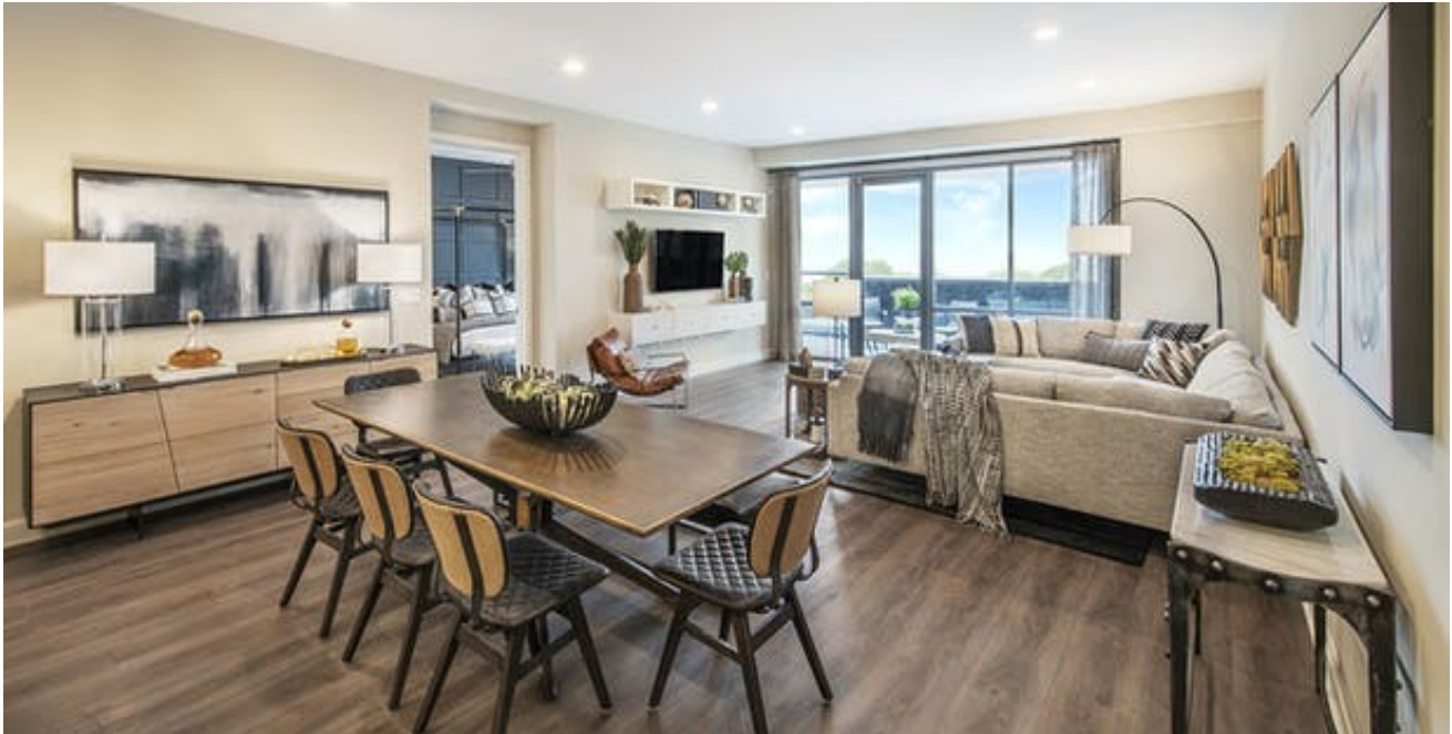
365 Ocean Residence Interior