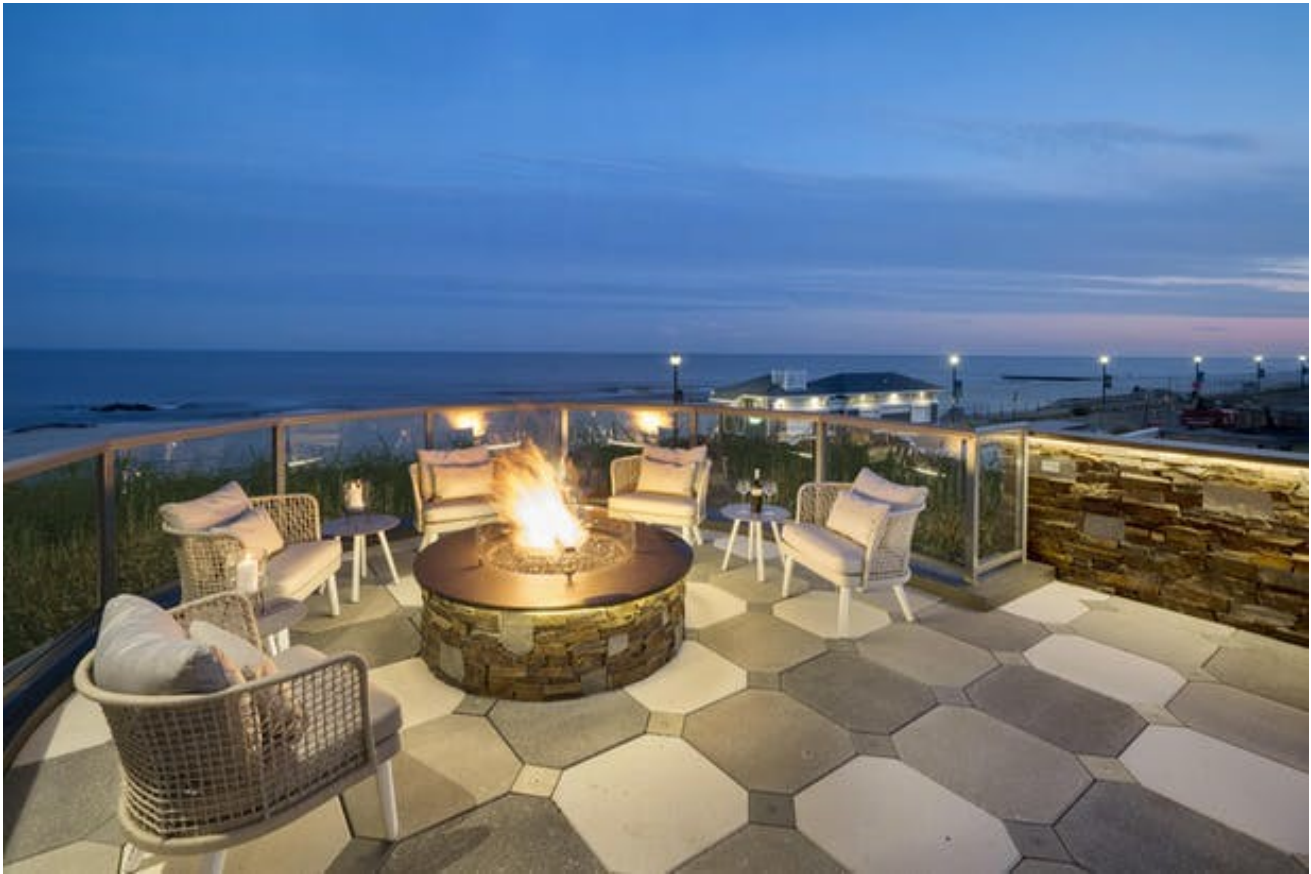
365 Ocean Fire Pit