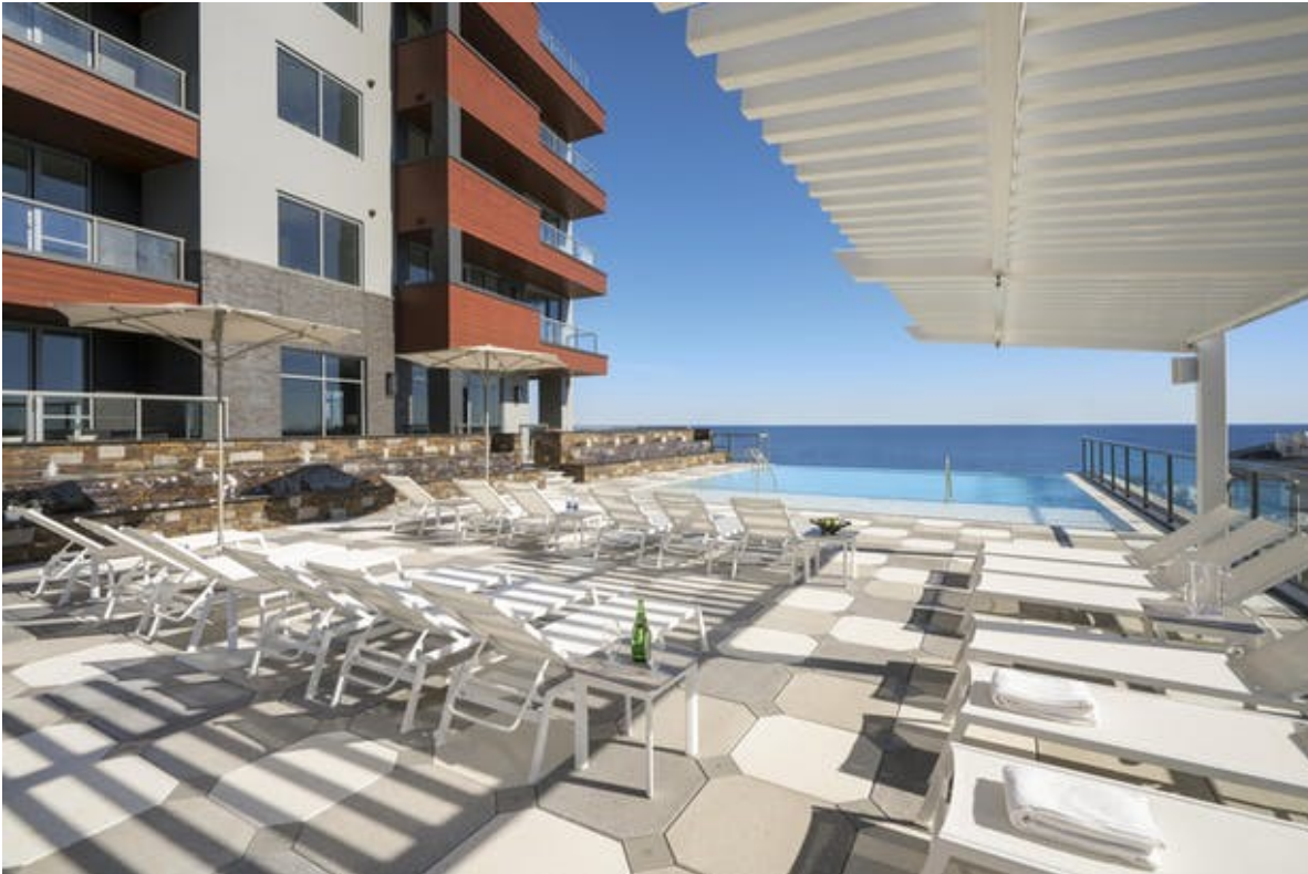
365 Ocean Sundeck and Pool

Developer Mark Built Homes is at the vanguard of a movement in Long Branch that is bringing upscale condominium living to one of the most vibrant and beautiful stretches of the Jersey Shore.