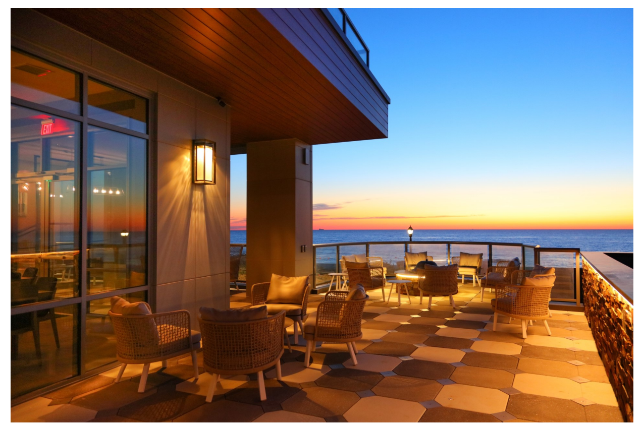
Luxury Residences in Long Branch Offer Resort-Style Amenities and Ocean Views